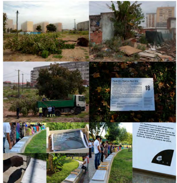
Figure 11: “Vitória Gardens Collection” © Sofia Borges

At some point, Sofia was the only artist remaining. And as people left their homes and machines tore apart everything, trees were the only survivors standing. Having documented everyday stories (about cooking, gardening, rituals) Sofia thought of making a “garden made of gardens.” Collecting then and there those same trees and plants, she wanted to create a memory of the life that once existed in Quinta da Vitória [Figure 11].