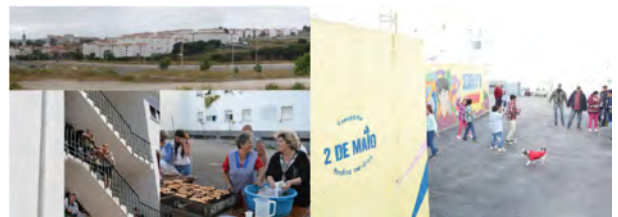
Figure 7: “2 de Maio” neighborhood and the logotype designed for the project.

Activities included the refurbishment of a store-floor to become the head-quarters of the local resident’s association; a group of artists to engage residents in painting the surrounding area; a series of participatory events to co-design an urban gardening plan. And another tactic to support a sense of collective ownership was to design a visual identity and materials to communicate to a wider audience [Figure 7].