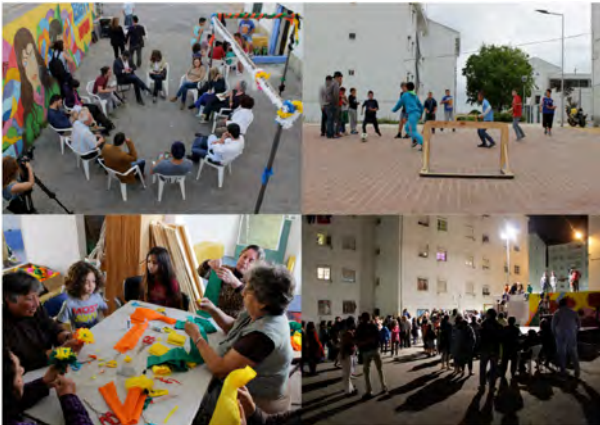
Figure 8: Events and activities for the celebration of the 40th anniversary of the Revolution, between 25/5/2014 and 2/5/2014

food and drinks, flowers to decorate the streets [Figure 8]. Insisting as well on making a 3D poster to welcome visitors.