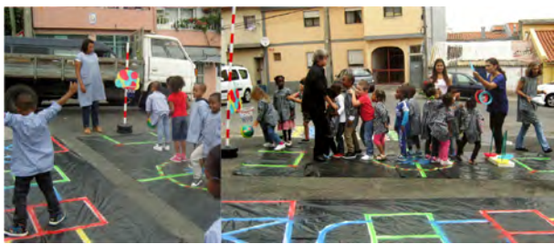
Figure 2: The 3 rd workshop with children in the Largo.

The following step, then, explored concrete proposals that negotiated both sides — how to maintain parking space and allow play, rest, green. An open call to the Faculty was made and 6 architecture students joined to co-design a proposal with every descriptive elements for implementation. During this time, a third workshop took place: rehearsing play and games in the Largo with children [Figure 2].