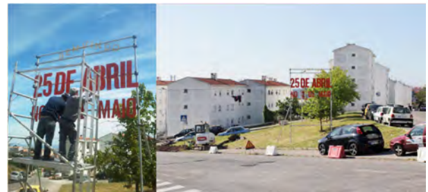
Figure 10: The 3D poster

When the structure finally arrived, it was enormous, heavier and more complex than imagined hence the delay. For windy conditions and possible vandalizing acts it worked better, but once the WELCOME and the 25 OF APRIL IN 2 OF MAY were up, it was the end (of fun) [Figure 10].