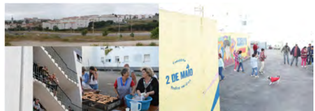
Figure 7: “2 de Maio” neighborhood and the logotype designed for the project.

Activities included the refurbishment of a store-floor to become the head-quarters of the local resident’s association; a group of artists to engage residents in painting the surrounding area; a series of participatory events to co-design an urban gardening plan. And another tactic to support a sense of collective ownership was to design a visual identity and materials to communicate to a wider audience [Figure 7].