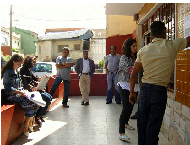
Figure 6: Posting the wall-newspaper (case study accounted in the previous chapter)

To rescue a famous quote by Marshal McLuhan (2011): “any understanding of social and cultural change is impossible without a knowledge of the way media works as environments”. The wall-newspaper encapsulates in its nature as communication medium the entire project’s approach to people - as passive consumers of its content. Thus, in an unpredictable but also certain move, grasped in the faces of people during posting [Figure 6], the active response was to kill the environment.