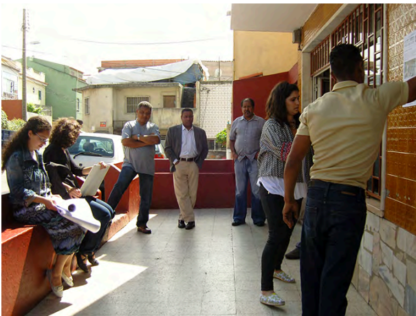
Figure 6: Posting the wall-newspaper (case study accounted in the previous chapter)

To rescue a famous quote by Marshal McLuhan (2011): “any understanding of social and cultural change is impossible without a knowledge of the way media works as environments”. The wall-newspaper encapsulates in its nature as communication medium the entire project’s approach to people - as passive consumers of its content. Thus, in an unpredictable but also certain move, grasped in the faces of people during posting [Figure 6], the active response was to kill the environment.