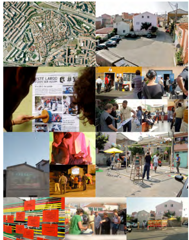
Figure 1: The Largo (square) and first activities of the project “Exploring Relational Space and the ‘Right to the City’. Experimental Research at Cova da Moura, Amadora, Greater Lisbon.” Research project funded by FCT-Foundation for Science and Technology with

Parring with an ongoing ethnographic engagement a series of formal participatory workshops were planned and titled “This Square could be like this”. And to set the project officially on we began with the posting of a wall-newspaper. A tool to introduce the project, communicate activities and serve as a record of the process (as well as, specifically, the main reason for inviting a graphic designer with an interest in activist practices) [Figure 1].