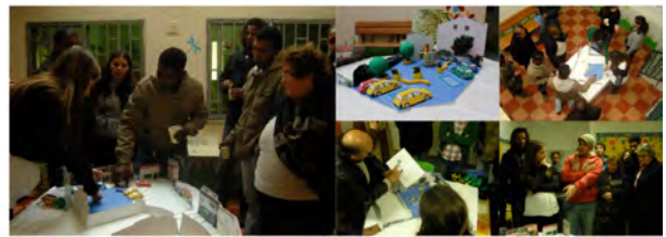
Figure 3: The last workshop: “You need to know the people, the owners of the cars, there is still work to do... People who come or are just passing for a matter of minutes naturally they look and ‘that is nice, it might be this way, that is fantastic’... But the everyday, the reality is another thing.” — JH, resident

The next workshop was the public presentation of the proposal [Figure 3]. Reaching the highest peak of collective conflict and discussion, intervention became a yes or no question. As all participants agreed to disagree it became the last formal participatory workshop and eventually, nothing more happened in the Largo.