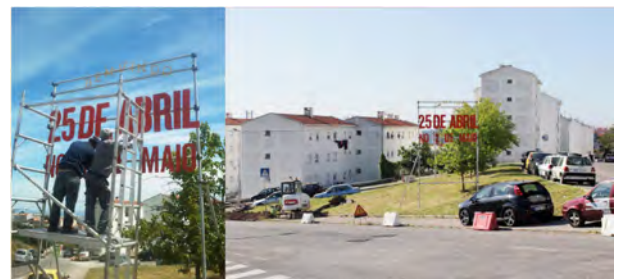
Figure 10: The 3D poster

When the structure finally arrived, it was enormous, heavier and more complex than imagined hence the delay. For windy conditions and possible vandalizing acts it worked better, but once the WELCOME and the 25 OF APRIL IN 2 OF MAY were up, it was the end (of fun) [Figure 10].