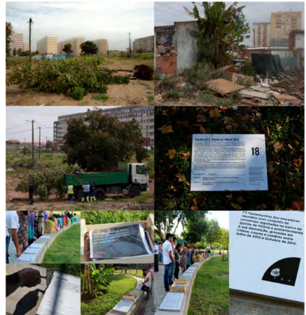
Figure 11: “Vitória Gardens Collection” © Sofia Borges

At some point, Sofia was the only artist remaining. And as people left their homes and machines tore apart everything, trees were the only survivors standing. Having documented everyday stories (about cooking, gardening, rituals) Sofia thought of making a “garden made of gardens.” Collecting then and there those same trees and plants, she wanted to create a memory of the life that once existed in Quinta da Vitória [Figure 11].