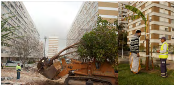
Figure 13: The Hindu community and the Ward gardeners as co-subjects

This non-human was indeed a radical invitation to the Ward to become officially implicated in the possible futures of the garden hence artistic collection. Guaranteed proper and full-time caring for trees, especially because few are sacred to the Hindu Community, was a matter of care for the artist [Figure 13]. But beyond problem-solving the contract was the very “interface” by which the contestation and performance of power relations unfolded (Kershavarz 2016, p. 53).