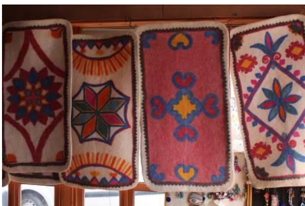
Figure 1: Traditional carpet examples with symmetrical compositions. Tire, Turkey, 2016.

Felting is based on hand and hand-operated low-tech machine production. Traditional products are usually composed symmetrically in both axes with repetition of motifs (Figure 1). The uncoloured wool, ivory or brown, is usually used as the base colour, and dyed wool is used to decorate. Making traditional felt products requires muscle force due to their size and thickness. For example, a 1.5 x 2-metre carpet is made of ten kilograms of wool which requires three times more water. As a result, making felt pieces in big sizes requires the collaboration of at least two craftspeople.