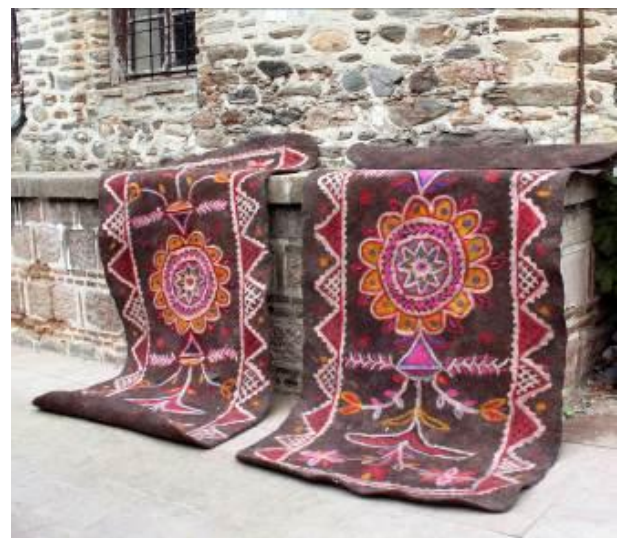
Figure 4: Carpets made by İlyas. He uses public spaces to leave pieces to dry and to exhibit them. Tire, Turkey, 2016.

making] can't coexist [at one workshop], it [scarf making] is a clean job. For example, you can't dirty a scarf; a person coming from Istanbul won't buy it. But [a] shepherd cloak is not like that. The use areas are different.