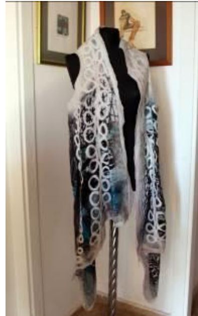
Figure 6: A vest by Ayfer. She identifies this piece as her artistic interpretation of a typical product. Wool is combined with silk fabric. Seferihisar, Turkey, 2016.

In all three cases, the production techniques are the same in terms of applying pressure on the wool, yet each craftsperson has her own characteristics concerning production procedure, production space, and produced artefacts. Design has different roles in each case that influences the visibility of the craftsperson in terms of engaging within several environments, such as mentoring workshops at the universities, offering courses for hobby teachers, or collaborating with the Ministry of Culture. As a result of the increase in visibility and size of the audience, craftspeople reconfigure their way of working as a means of creating new collaboration options with other craftspeople, like tailors, and skilful local women.