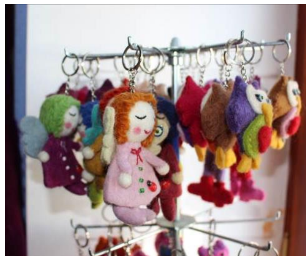
Figure 7: Keychains made by women at Ayfer's studio as piecework. Seferihisar, Turkey, 2016.

As the other result of empowering the self, the craftsperson develops an ability to provide opportunities and potentials for her local community. Both Gencer and Ayfer collaborate with local women during the production process. For example, the local women make keychains (Figure 7) at Ayfer's studio and they charge Ayfer based on the number of pieces they produce during the day.