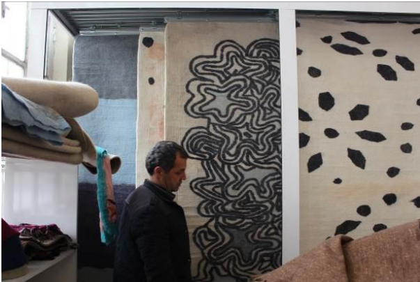
Figure 5: Carpets made by Gencer and his designer partner. Yalvaç, Turkey, 2016.

In his own designs, he is open to experimenting with new product types, such as garments and accessories, as well as producing carpets with traditional designs. He collaborates with local women in the production of some pieces, such as stitching on purses and slippers. He rarely duplicates his products. As a second practice, he reconditions the wool he collects from locals: to produce fine and soft products, he compiles only thin wool pieces from the pile he collected. Recently, he started wool generation as an additional business to felting.