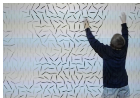
Figure 3: Somatics : With real-time visualizations of their movements, children on the autistic spectrum explored and engaged in their own movement in sophisticated and social ways, and led us to question the discarding of what is considered atypical movements