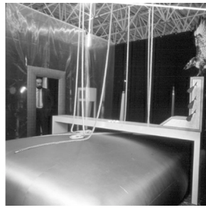
Figure 2: Archizoom Associati, "Gazebo Centro di cospirazione eclettica", XIV Triennale di Milano (1968).