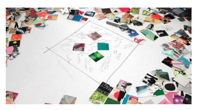
Figure 3; Snapshot from Visionpool Workshop at Learning Lab Denmark.

Visionpool is a large collection of Visual Samples. A Visual Sample is a square cut-out of the infinite amount of visual expressions surrounding us, supplied to Visionpool by Danish artists and designers. The most important aspect of a Visual Sample is its ability to initiate associations. The collection of Visual Samples exists on the web as well as on printed cards.