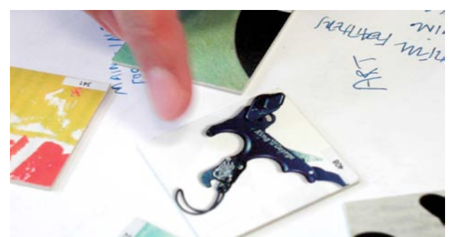
Figure 2; Snapshot from Visionpool Workshop at Learning Lab Denmark.

Visionpool Basic Deck 1.0 is a commercial product and comes with 330 individual numbered Visual Samples, a pad of Visionpool stages, 'Introduction to Visionpool' describing the fundamental rules and a number of Visionpool cases and Access to web-powered workshop documentation by VisionPad at www.visionpool.dk.