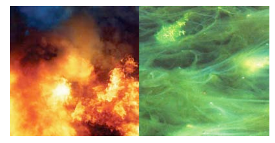
Figure 4; Visual Sample #1402 and #1398

Visionpool and other methods using pictures as tools for innovation have been used by Visual Intelligence since 2001 for LerningLab Denmark, DR-TV, Malmö Högskola/ K3, Sveriges Television, Den Europæiske Filmhøjskole, The FilmTrain Project/ Syddansk Univesitet, TeamToft, Microsoft Business Solutions, Novo Nordisk Enginering, Terma a/s, MAB; Moving Art in Business, Erhvervs- og Selskabsstyrelsen, and others.