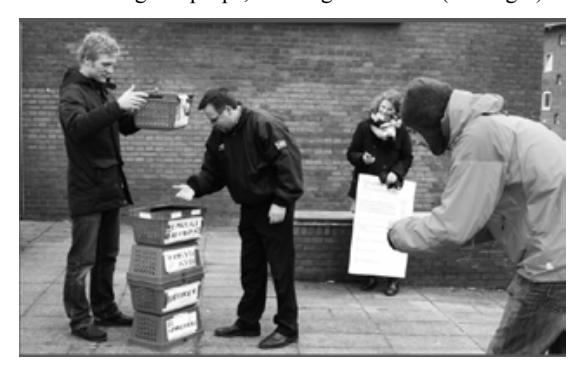
Figure 1: Prototyping ("Rehearsing the Future")

development of the toolbox. It brings new examples on how roleplaying and experience prototyping can be another way to experiment with and imagine new possible futures in the lab. Prototypes and mock-ups enter the stage as props, evoking new ideas (see Fig.1).