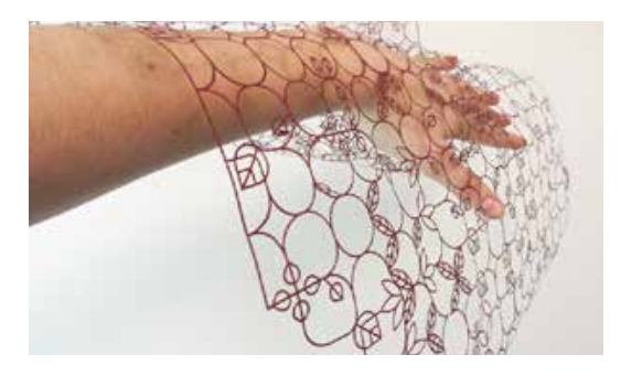
Figure 3: Finished lace panel.

The finished cut pieces can be viewed individually and aesthetically as discrete artworks, or they can be arranged horizontally in space to visualize the program's progression over time. Using rapid prototyping technology like the laser cutter allows the realization of multiple incremental stages of an artwork that would be expensive, time consuming, or impossible to make with traditional production methods. Digital Lace leverages the best of both worlds of 'mass customization': individually unique and unpredictable designs are created using the tools of precision manufacturing.