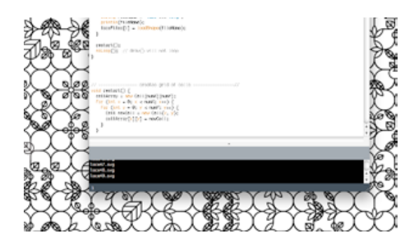
Figure 2: Screenshot of the Processing environment and the Generative Lace program running in the background.

Game of Life uses cells that are either on (black) or off (white). Each time the program runs the individual cells check on the state of their neighbours. If a cell has two or three neighbours it remains black otherwise it becomes white. If a white cell has exactly three neighbours it reverts back to black. The Game of Life and the Digital Lace program both use object-oriented programing conventions to create a grid of semiautonomous cells that can respond to the action of neighbouring cells. Pearson shows how the original Game of Life program can be altered to include an infinite number of states beyond just on or off so more complex behaviours can be examined. The Digital Lace program builds off this base, starting with a grid of cells is randomly populated with graphics from the symbol set library. When the user clicks, each cell mathematically averages the numbers assigned to the eight cells adjacent to it. Using that value rounded to the closest integer, the program selects the next symbol file to populate that cell with. Over time this creates a grouping effect, because individual cells are working to make themselves more like their neighbours. Homogenization is prevented by randomly reassigning a number to cells whose neighbours have reached the maximum or minimum value.