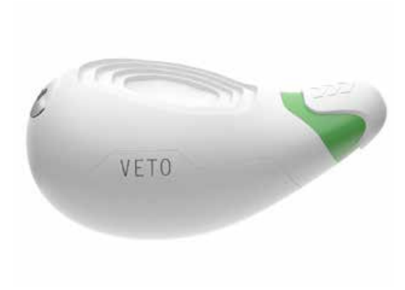
Figure 4: VETO home abortion product in a side -view

the risk of putting guilt and shame on women. This was also debated on the wall, one person wrote: "Veto-what a great name! Women should have veto rights over their bodies. Women should have the right to have an abortion when, how and of what reason they choose."