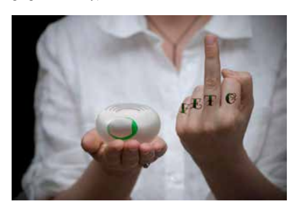
Figure 1: Abort 'n Go with VETO home abortion product.

(https://soundcloud.com/reclaim-the-tant/abort-n-go-produced-by)