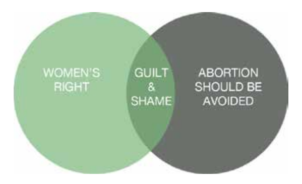
Figure 2: The double norms on abortion.

Abortion is viewed upon as a right, that should be avoided, and only to be used as a last option. (Socialstyrelsen, 2005) (Bacchi, 1999) This view that abortion is wrong, and should be avoided, has subsequent affects on how women experience an abortion. A woman in Kero's study asked: ."Am I inhuman to only have felt relief after the abortion?" I conducted two indepht interviews, and several short interviews/discussions with women. One woman I interviewed felt that the staff wanted to punish her. She also told me that she felt questioned and stigmatised by the doctor about having an abortion This led to a situation where she didn't dare to tell that the doctor that it was her second abortion. A nurse I spoke to told me about a woman who were having her third abortion at the hospital. When the woman was sedated during the abortion procedure, the staff, glued a condom on her stomach, to punish her, in their view, unacceptable behaviour!