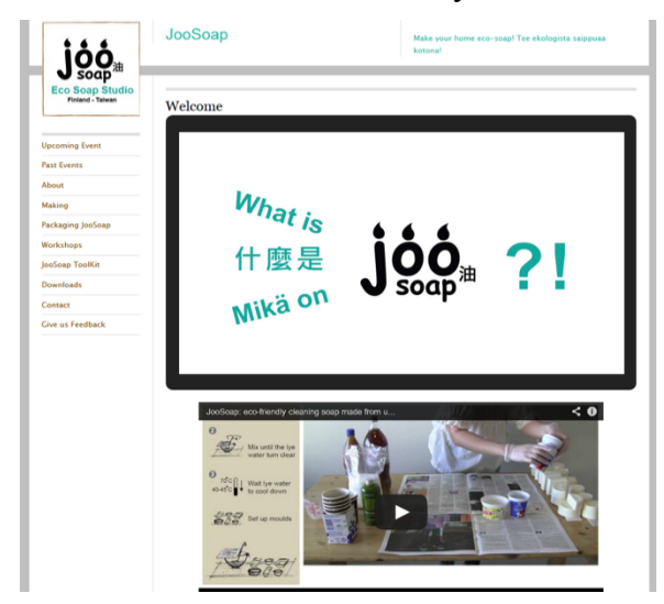
Figure 3 JooSoap Studio's main website. A how-to video welcomes visitors to the site

1) Prototyping of an online repository of ecosoap knowledge and activities, as a type of knowledge commons (Hess & Ostrom 2011) that could support communication and collective action in flexible ways.