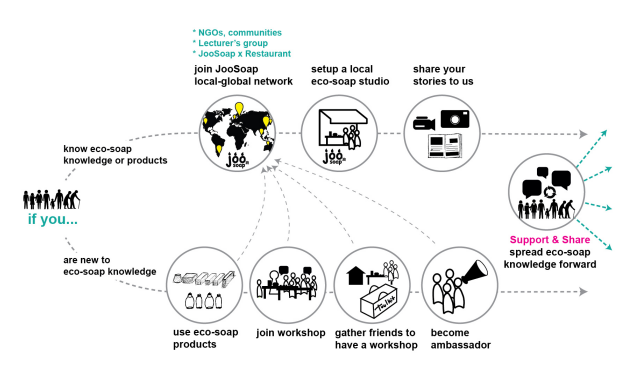
Figure 7 Strategic orientation for Eco-soap knowledge - JooStudio

the same time explore alternative practices (like more media sharing) for making eco-soap together with participants.