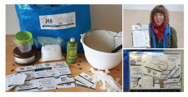
Figure 6 JooSoap toolkit for trying-out eco-soap making

The most developed one is the idea of co-making workshops , events were more than lecturing style (as in the original format of the Maple studio), there is more encouragement for open discussion and co-creation of all aspects of eco-soap making (packaging included) and specially open discussion of the challenges and opportunities of eco-soap making together and sustainable practices.