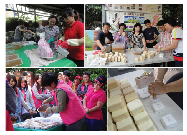
Figure 1 Making together eco-soap from used cooking oil in the Maple eco-soap studio (Taiwan) - Taichung Maple Culture Association.

Taichung Maple Culture Association (see <u>http://www.maple.org.tw</u>), is formed by active residents of Taichung, in Taiwan that have developed over the course of the last decades a considerable amount of concrete experiences and networking practices for making ecological cleaning soap from recycled cooking oil (Figure 1); while at the same time raising awareness of environment and other health issues around eco-soap.