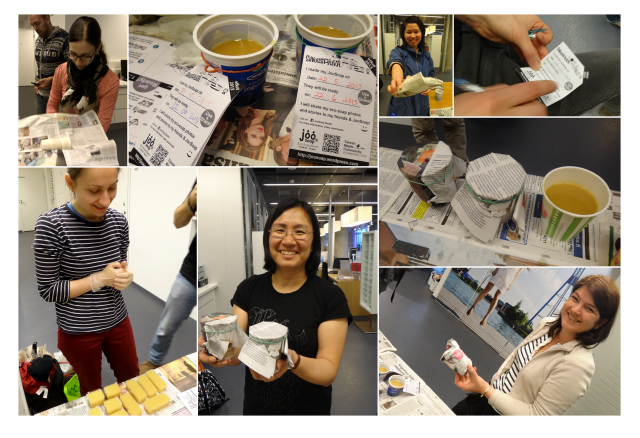
Figure 5 Snapshots from a co-making workshop in Finland. Instructions and labels are printed for all to use

2) Envisioning and prototyping future ecosoap making together practices that can be supported and augmented by the above mentioned knowledge commons (Figure 5).