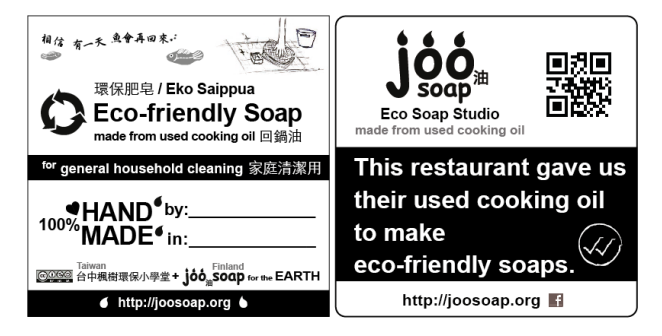
Figure 4 Example of labels that assists the workshop activities.

The repository includes documentation of activities and learning from previous and future concrete experiences by eco-soap knowledge activists in the form of stories, events and news (on going). We have also design, translate and produce in different media (video, pictures/illustrations, text) resources such as guidelines and scripts for workshops, workshop props and toolkits, ecosoap instructions and recipes (Figure 4). The materials are free to download and use. Prototypes have been implemented with the help of different cloud services. E.g. JooSoap Studio website (blog platform), a networking place (Facebook page and group), audio-visual documentation repository (YouTube channel), and a series of DIY instructions and resources like labels and packaging ideas (instructables.com). The materials have been spreading nicely and we have got many requests for info and contacts from abroad.