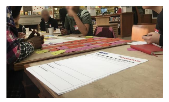
Image 2: The co-design workshop designed and facilitated by students; participants included front line library staff, central library administration, family members participating in existing reentry services offered at the library and representatives from civil society organizations (CSOs)

Based on the learnings from the workshop, students created design proposals for the second half of their studio. This design research process conducted by the students contributed to reinforcing and materializing an expanded understanding about what libraries may need to prioritize in supporting their staff as they redefine their role. The concepts were comprised of a mix of communication and service ideas, that included: events where staff could learn to interact with patrons through game-like activities and props designed to help drop barriers related to the stigma of incarceration; events for formerly incarcerated patrons and the general public to engage in political action and movement building toward criminal justice reform; a new ID card that embodies and informs patrons about the new role of the library as a community resource; bookmarks designed to help stakeholders navigate the fragmented reentry landscape of services by also developing processes that connect the dots between the various resources available.