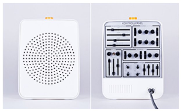
Figure 7: The front of the radio is simple and easy to operate for a person with dementia or a care worker pressed for time. The back of the radio is complex visualising the amount of information intuitively handled in singing a song interpreted as buttons and levers in a machine.

This discursive object is turning the simple interpersonal act of singing to calm the elderly into technology. Many of the tasks formerly performed by people are suggested to be replaced by technology due to the decrease in population where fewer people are to take care of an ageing population, which means that care must become more efficient. A song sung by a person is most certainly cost efficient. The Care Song Radio aims to make visible the complexity of assessments made when singing a song, adapted to a particular person, thus problematizing the image of technology as cost efficient. The complexity of the levers and buttons at the back of the radio also aims to highlight the extent and depth of knowledge acquired through care, which risk being overlooked in the implementation of technology in care.