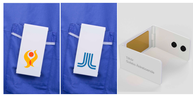
Figure 5: Logotypes on Elevator Stopper