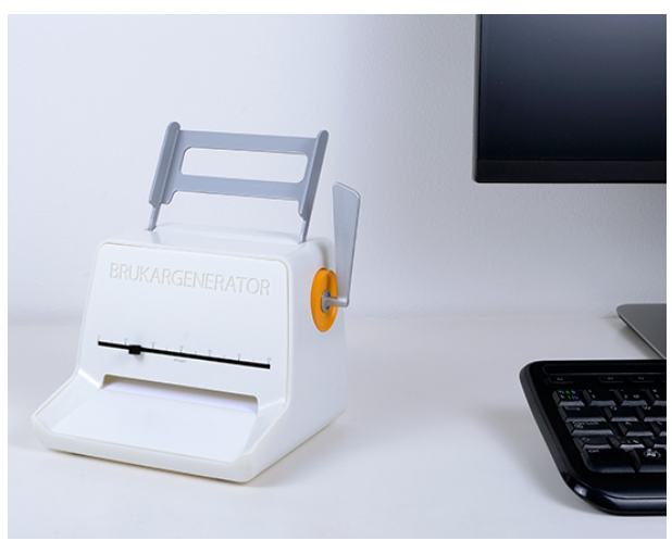
Figure 1: The Client Generator

paper. We present three discursive objects that were developed by two of the main authors and others (see acknowledgments section) in a collaborative project created in a Research and Critical Design approach. As following the logic of Critical Design these examples are not intended as products to be produced or to solve a problem, but rather to visualise a "problematic" (in the philosophical sense of Foucault and Smith).