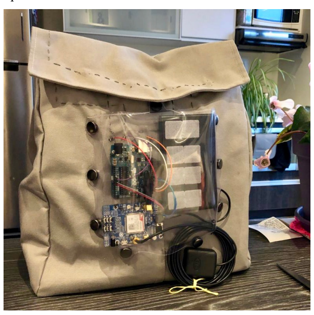
Figure 5: The final iteration of La Encomienda. In the front, the textile bag has a plastic pocket that contains a microcontroller prototyping board, a cellular module, an antenna and a packet of AA batteries.

With this in mind, we created a chain of material correspondence in which women from each sewing circle could exchange material memories from their local ecologies. Once the material correspondence reached each sewing circle, a text message—Short Message Service (SMS)<sup>4</sup>—was delivered; both to the members of the circle opening the correspondence, and to the members of the circles where La Encomienda had already been, to acknowledge that the parcel had been opened.