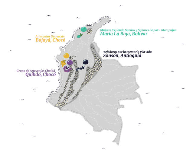
Figure 1: The four Colombian regions in which the memory sewing collectives are located.

Throughout this exploratory paper we unfold two material metaphors, called 'prototypes', that have emerged out of two living labs with four communities that we assert are forms of doing design with care, focusing on attentive listening to what happens when communities interact with digital textiles. The first prototype was designed by searching to embody an idea of reconciliation as something that is more visible when participants of the communities are together. This led to further material explorations that sustained the emergence of a second prototype: 'La encomienda<sup>2</sup>', which was meant to think of long distance reconciliation, new senses of collectivity and how communities can establish a connection that can produce common reconciliation strategies that are careful of, and sensitive to, the local realities.