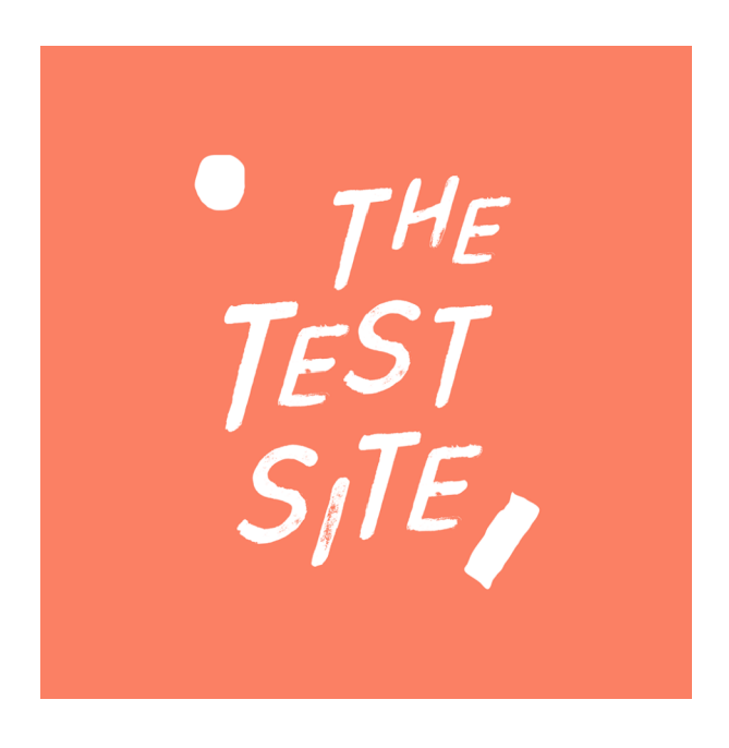
Figure 4: The logo

Moreover, physical acts of future-making included aspects of space design and planning of work processes such as where to source material, were to place them at the site and sequences of assembly (e.g. the shelter). In addition, the Test Site participants needed to design the organisational structure and how they communicate with each other. Finally, they had to figure out how to represent their activities or what in commercial terms would called branding and includes naming the site or designing a logo (see figure 4).