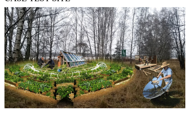
Figure 1: Photoshop visualization by one of the students

'Test Site' is an open space located on the campus of Aalto University in an outer city district of Otaniemi in the greater Helsinki region. This outdoor space was set up at the start of 2018 by students who were interested to explore low-tech, frugal innovations for sustainability, and is funded and planned to exist for a minimum of two years. From the beginning the exploration was planned to target both infrastructure such as water, energy and sanitation, food, soil health and food production issues, material circulation, but also