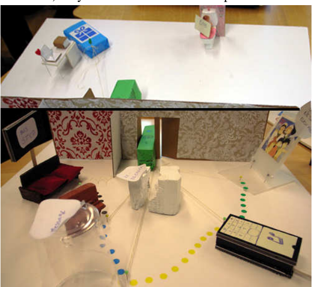
Figure 6. 3-dimensional "Service Landscape" illustrating initial views of the "Backstage" and different "Frontstage Touchpoints".

As a a tutor I also opened a box of "basic" design materials for example including stickers, strings, disposable cups, etc, but mainly through a quick tour in their studio and at the school the groups collaboratively found the images and objects ("project-specific" design materials ) they needed to illustrate their points.