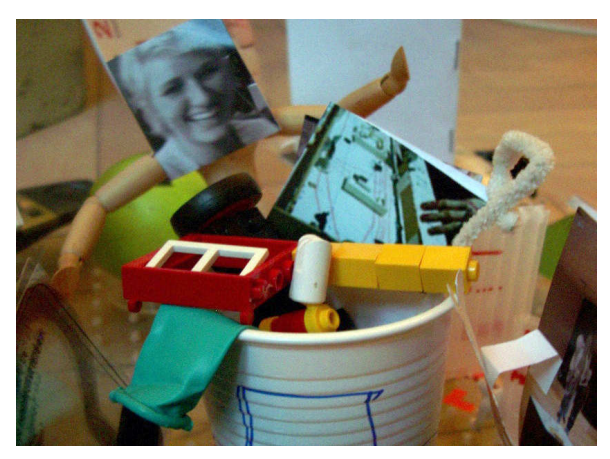
Figure 2. A mixed collection of tangible 2- and 3-dimensional design materials.

Some design materials can be characterized as "basic" like; pens, colored papers, foam blocks, clay, disposable cups, pipe- cleaners, game-pieces, tennis balls, hats, etc. "Basic" indicates that some(one) have brought them along to a co-design situation, but without any specific plans about their use or meaning (on meanings of artefacts e.g. see Krippendorff, K., 2006). Others can be characterized as "pre-designed"; such as printed images, access to selected video-clips, foam & paper models or mock-ups, prototypes, etc. "Predesigned" indicates that some(one) in the design team has selected, prepared or designed these before a meeting. Both of these can aslo be characterized as "field/project specific", if they have been personally or collaboratively choosen or created particularly in relation to an ongoing project. - Whatever the starting point, they are all viewed as design materials which codesigners can engage in, explore, combine, and add meaning during co-design situations. Additionally, design materials are both viewed as what is brought into a co-design situation to be explored collaboratively (described above) and what comes out for the continuous design process (e.g. co-designed mock-ups, "landscapes", or visual representations of these, etc.).